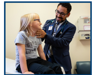
July 12-13, 2019 Sanford Black Hills Pediatric Symposium