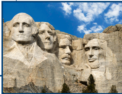
1941 Mount Rushmore Completed